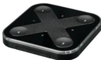
Wireless Wall Control