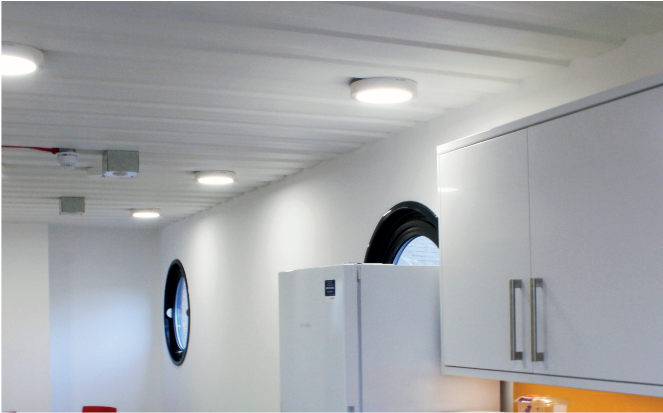
MBNA Thames Clipper