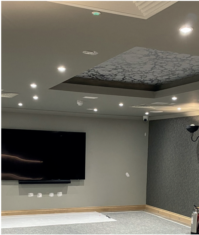
Wood Bridge Care Home