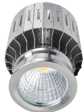
ILS 13W &amp; 18W

A competitive, interchangeable and architectural LED downlight system. An alternative light engine to an MR16 or GU10 lamp.